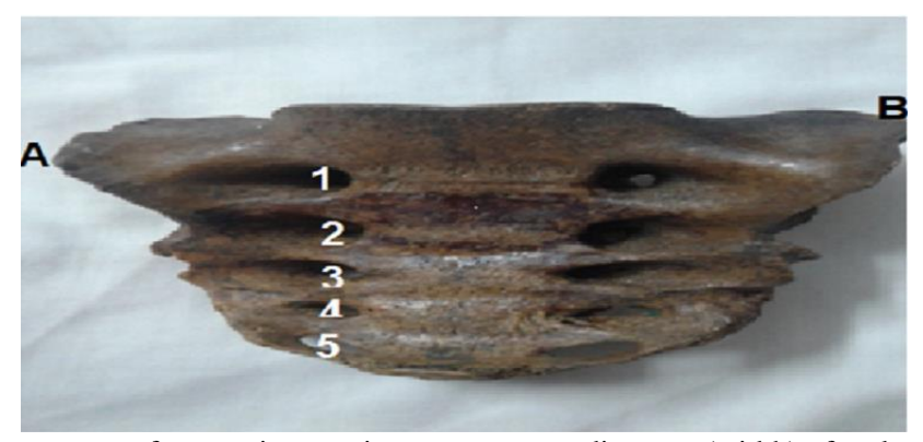
Fig 2: Showing a pattern of measuring maximum transverse diameter (width) of male sacrum; distance between points (A and B). Also, it shows 5 pairs of anterior sacral foramina.