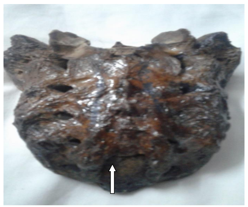
Fig 7: Showing an Elongated U shaped sacral hiatus.