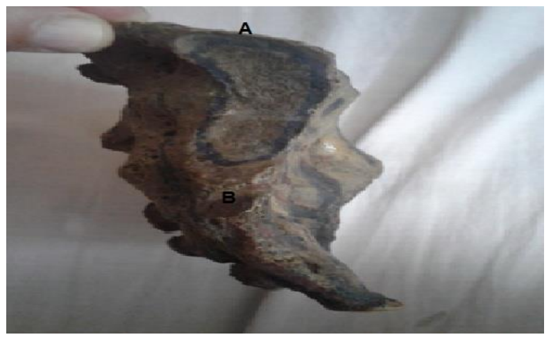
Fig 4: Showing a pattern of measuring the auricular surface length of sacrum; distance between points (A and B).