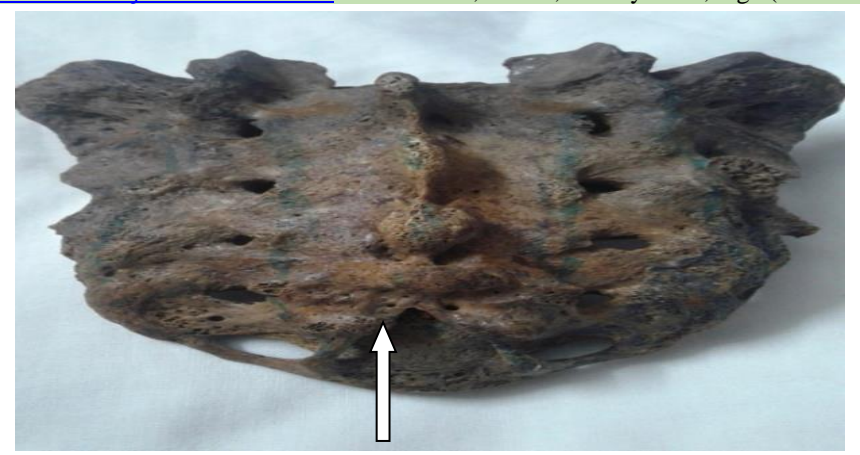
Fig 8: Showing an Elongated V shaped sacral hiatus.