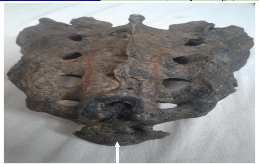
Fig 5: Showing an inverted U shaped sacral hiatus.