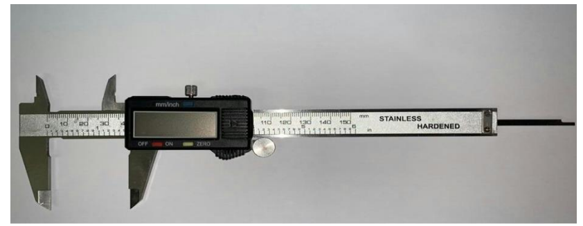
Fig I: Showing a Vernier digital calipers with an accuracy of 0.1mm.