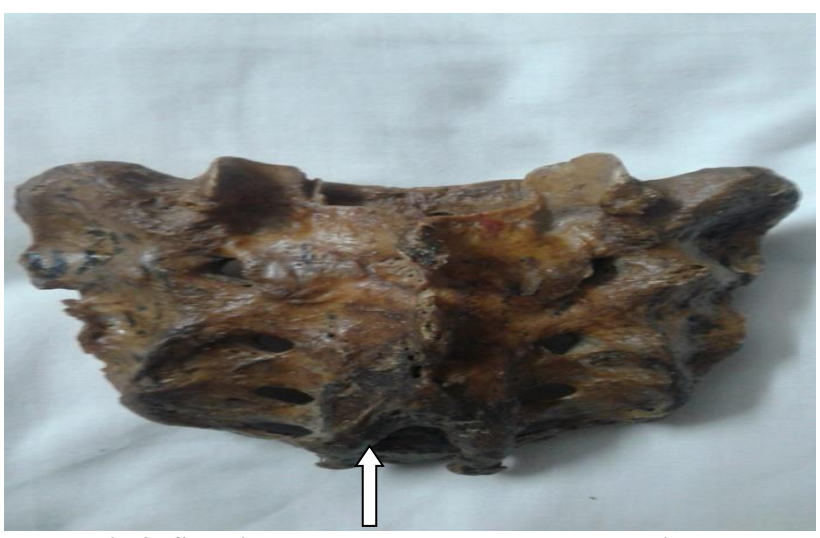
Fig 9: Showing an Inverted V shaped sacral hiatus.