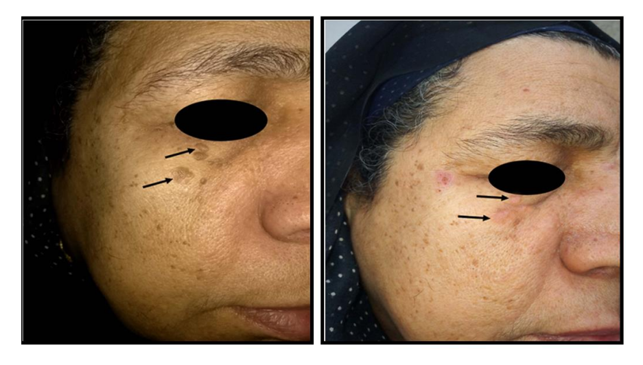
Figure 1: Complete remission of the lesion in the Laser group.