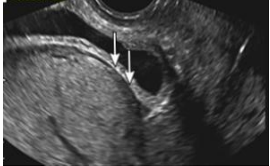
Figure (3): Ultrasonic image of Placenta previa with accreta revealed in Transvaginal image of the lower uterine segment in a patient with placenta previa shows a thin myometrium (arrows) in the

region of prior cesarean delivery scar due to placenta accreta.