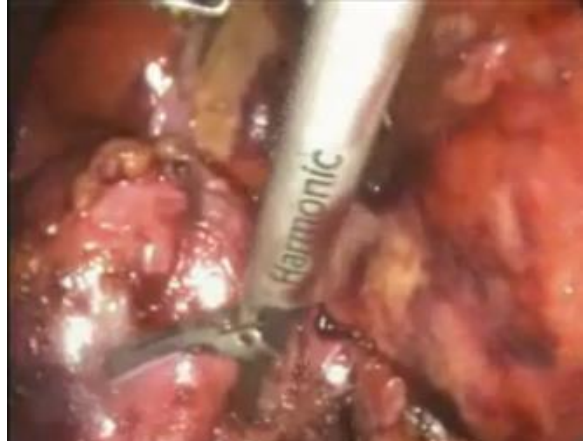
Figure (1): A. Multiple hydatid cysts. B. Traumatic hydatid cyst. C. Cysto-Biliary communication. D. Total closed peri-cystectomy. E. Exophytic hydatid cyst. F. Opened hydatid cyst. G. Aspiration of cyst content. H. Remanet part of the cyst wall adherent to IVC. I. Laparoscopic deroofing.

We did total or subtotal peri-cystectomy either closed or open. In total closed peri-cystectomy we remove the cyst without opening it with or without liver resection. This technique used in superficial cysts or exophytic cysts. While in open total pericystectomy; we open the cyst remove its content by suction irrigate the cyst with betadine remove the end-ocyst then remove the cyst wall. This done in deep-seated cysts or cysts closely related to the hepatic veins or inferior vena cava (IVC). In rare cases; cyst was adherent to major hepatic vein; we