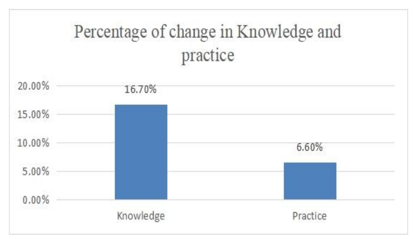
Figure 2: Percentage of change in knowledge and practice.