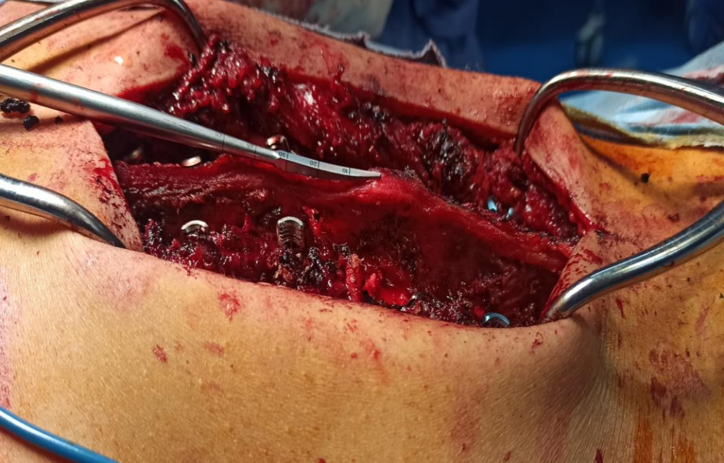
Figure (4): Intraoperative clinical photo of patient in figure (1) shows widened interspinous distance with tear of the supraspinous ligament

osteotomies and T9 to L2 fixation with local kyphosis and TLK improvement to only 15 and 10 degrees respectively.