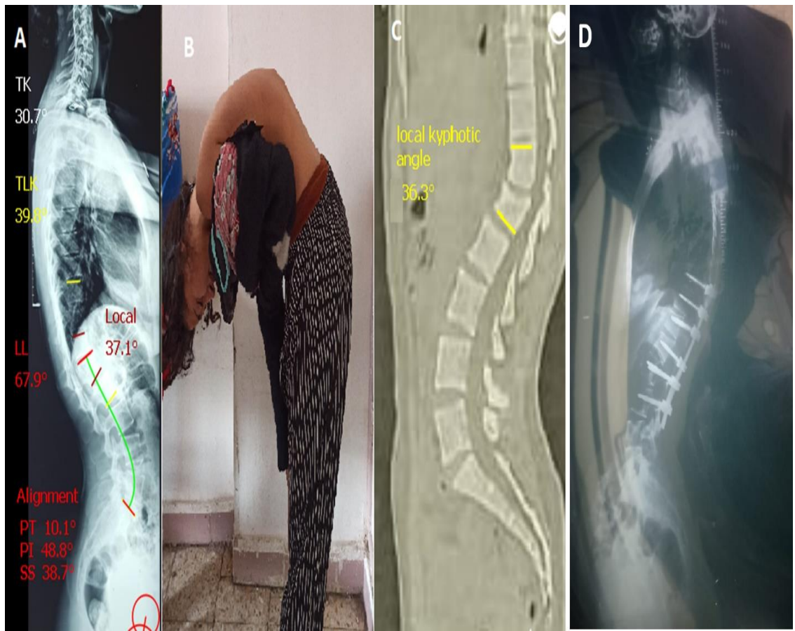
Figure (2): Female patient 20 years old with L1 fracture managed conservatively. A) Sagittal longstanding X-ray preoperative. B) clinical photo preoperative. C) Sagittal cut CT view preoperative. D) One year follow up after 3 Ponte osteotomies with fixation T10-L3.