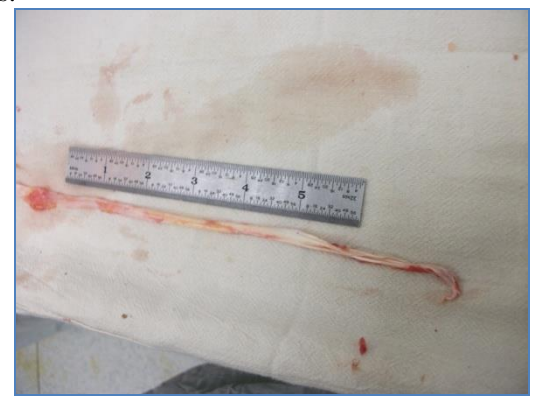
Figure (2): preparations of the autogenous semitendinosus graft.

Figure (1): the incision is centered in line with Langer's lines (vertical saber-type) approximately 1.5 cm medial to the AC joint and should be slightly angled to allow access laterally to the CA ligament and medially to the coracoid process.