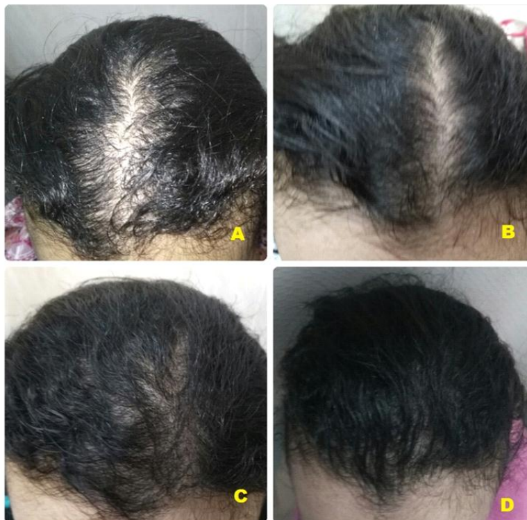
Fig (2): Female patient grade I AGA on Ludwig classification , (A) at start of therapy , (B, C) During treatment sessions and (D) After treatment with PRP injection sessions showing high improvement.