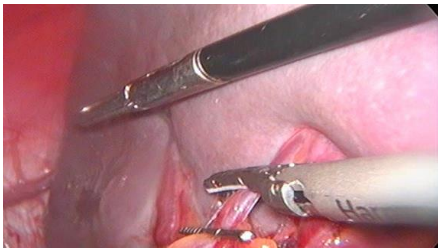
Figure 1. Photograph shows division of branch of splenic artery.

Mann Whitney U test. *P < 0.05 is significant. NS: Not significant. HS: highly significant.