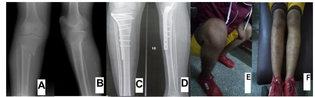
Figure :1 case1: Pre-operative x-ray anteroposerior(A) and lateral(B) views; (4) months follow up x-ray anteroposerior(C) and lateral(D) views showing full union of the fracture; full ROM ( 130^{\circ} flexion(E) / 0^{\circ} extention(F))