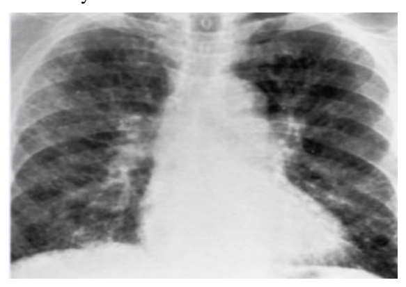
Figure (1): Bilateral basal reticulo-nodular opacity, prominent aortic knuckle & mild cardiomegaly.

The atypical manifestations had many differential diagnosis as atypical viral pneumonia, drug toxicity, interstitial lung disease & pulmonary edema, each had a characteristic pattern)