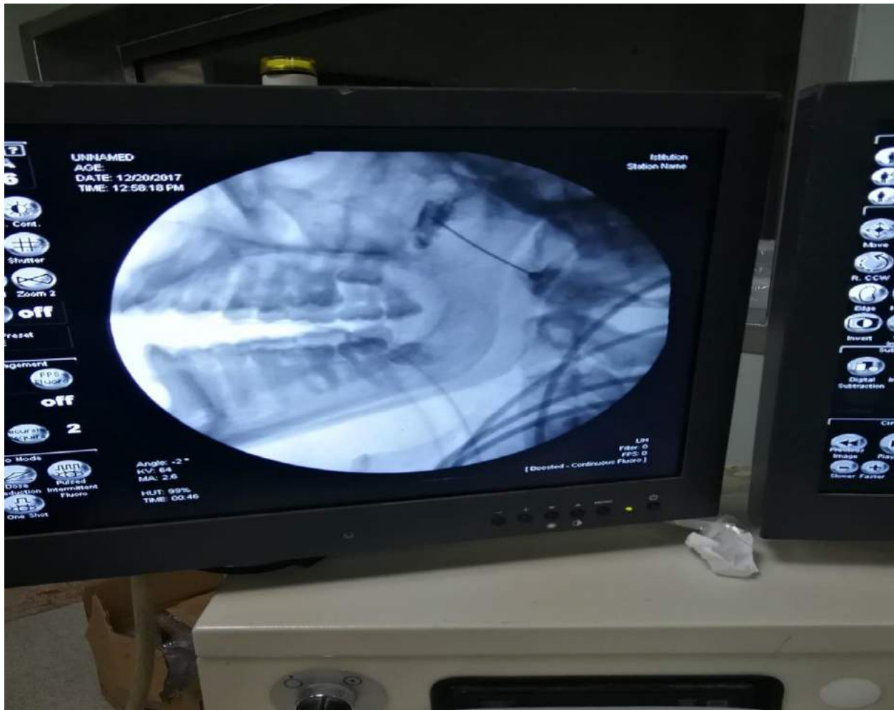
figure (1) Showing the needle in the “inverted vas” under x ray fluoroscopy (lateral view) which is pterygopalatine fossa where sphenopalatine ganglion placed during SPG block.