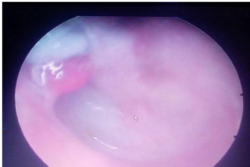
Fig(1 )preoperative otoendoscopy

-Pure tone audiometry and DW-MRI temporal bone are done 6 mo postoperative.