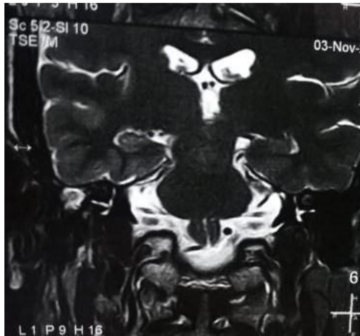
Fig(3) postoperative DW MRI showing rt recidivistic lesion