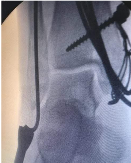
Fig(3) impeded of K wire