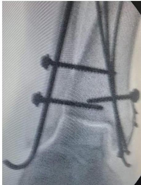
Fig(4): Applying Syndesmotomic screws