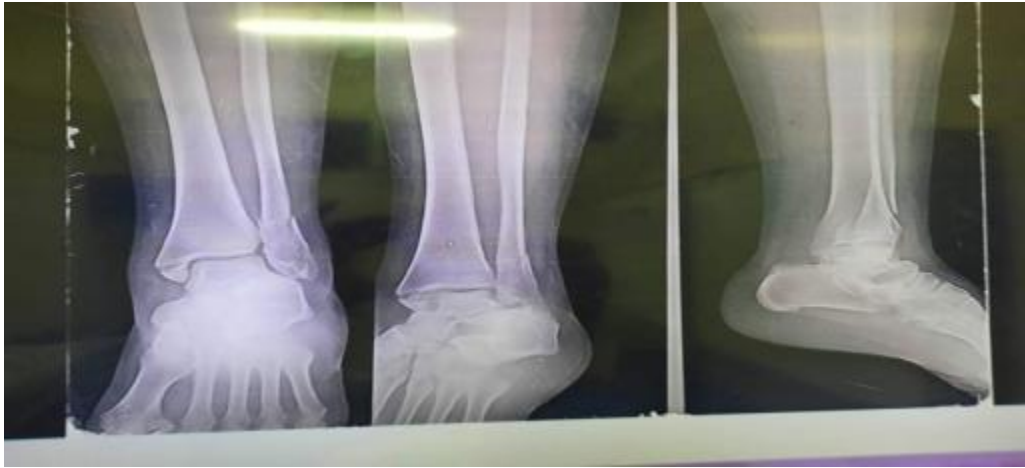
Fig (6a) pre-operative x-ray in Ap,Lat and mortise views