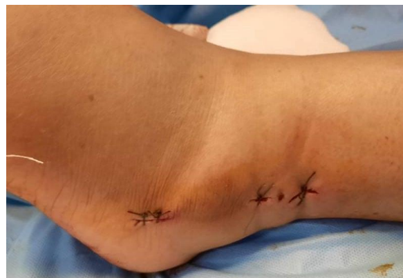
Fig(5) small size of wounds